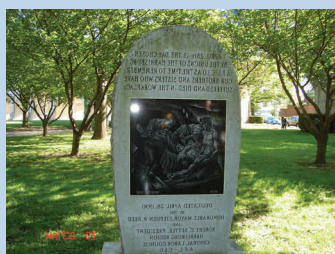
Visit the Injured Worker Memorial Park on Front St. in Harrisburg, PA.